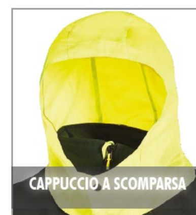
CAPPUCCIO A SCOMPARSA