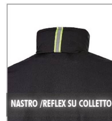
NASTRO /REFLEX SU COLLETO