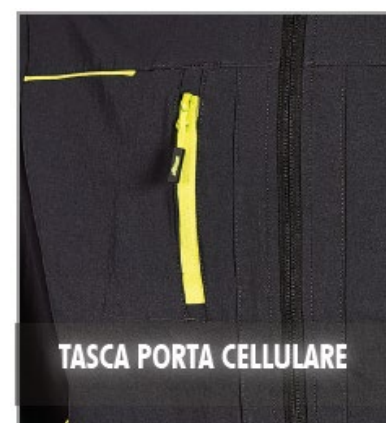
TASCA PORTA CELLULARE